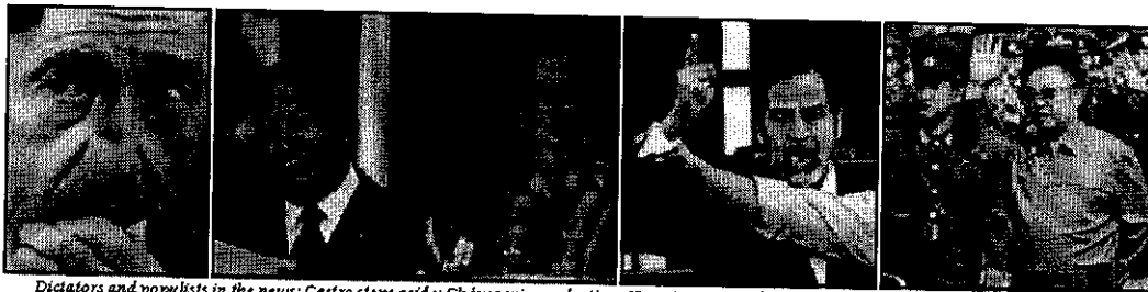
Dictators and populists in the news: Castro steps aside; Chávez wins reelection; Hussein sentenced and executed; Kim Jong-il tests nuclear missile.