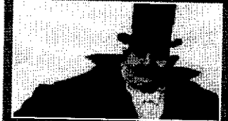
The Qualities of an Ideal UN Ambassador 2