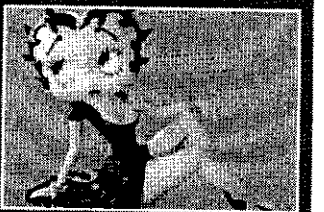
New Year Resolution 31