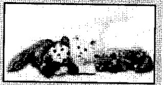
Teaching Your Child Restraint 34