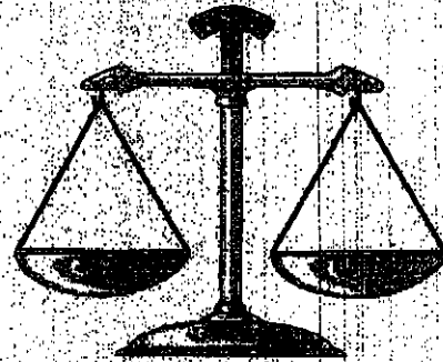
The scale of justice